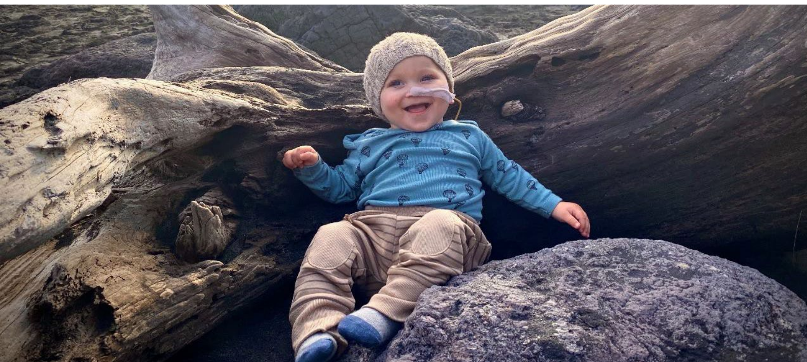
Photo: Practicing social distancing and self-isolation in New Zealand.